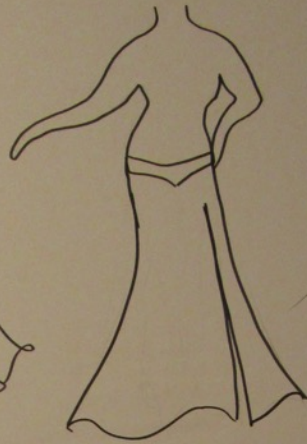
Skinny Circular SKIRT