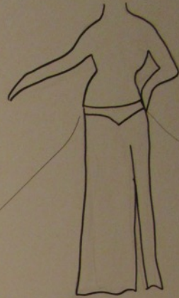
STRAIGHT or sarong style