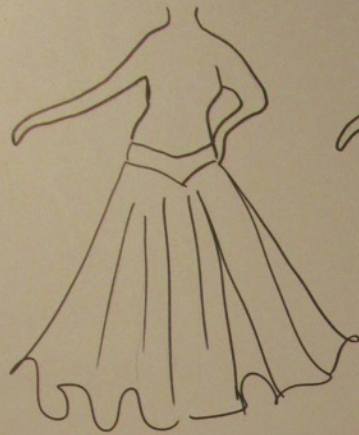
Full Circular SKIRT